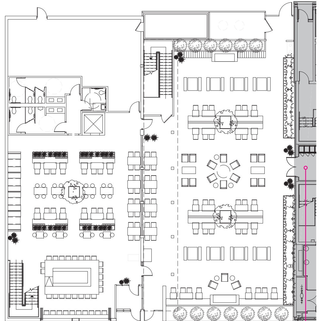
Interior: approx. 4,509 sf