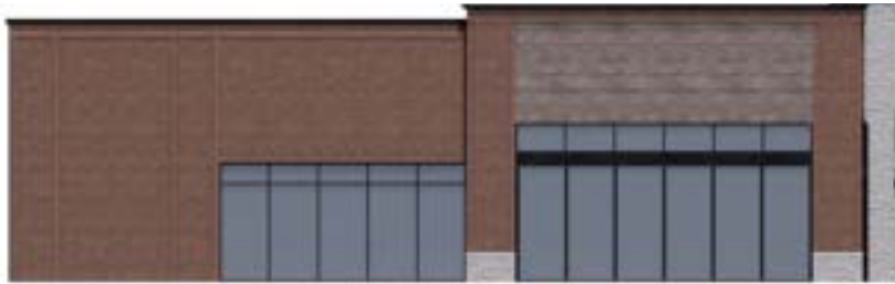
BUILDING 1 - WEST EXTERIOR ELEVATION