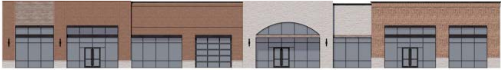
BUILDING 1 - SOUTH EXTERIOR ELEVATION