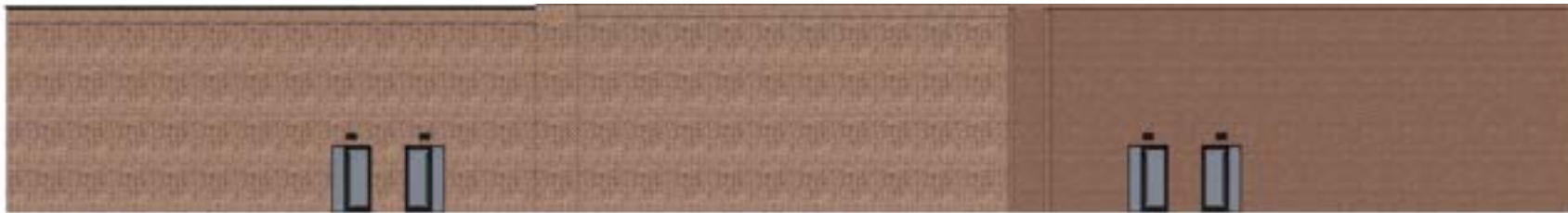
BUILDING 1 - NORTH EXTERIOR ELEVATION