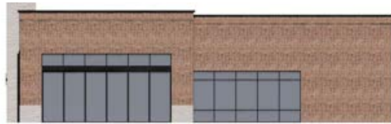
BUILDING 1 - EAST EXTERIOR ELEVATION