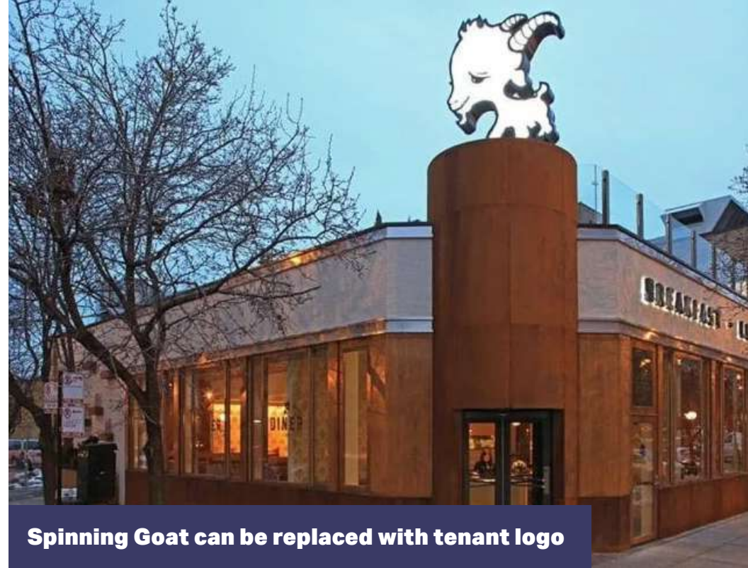
Spinning Goat can be replaced with tenant logo