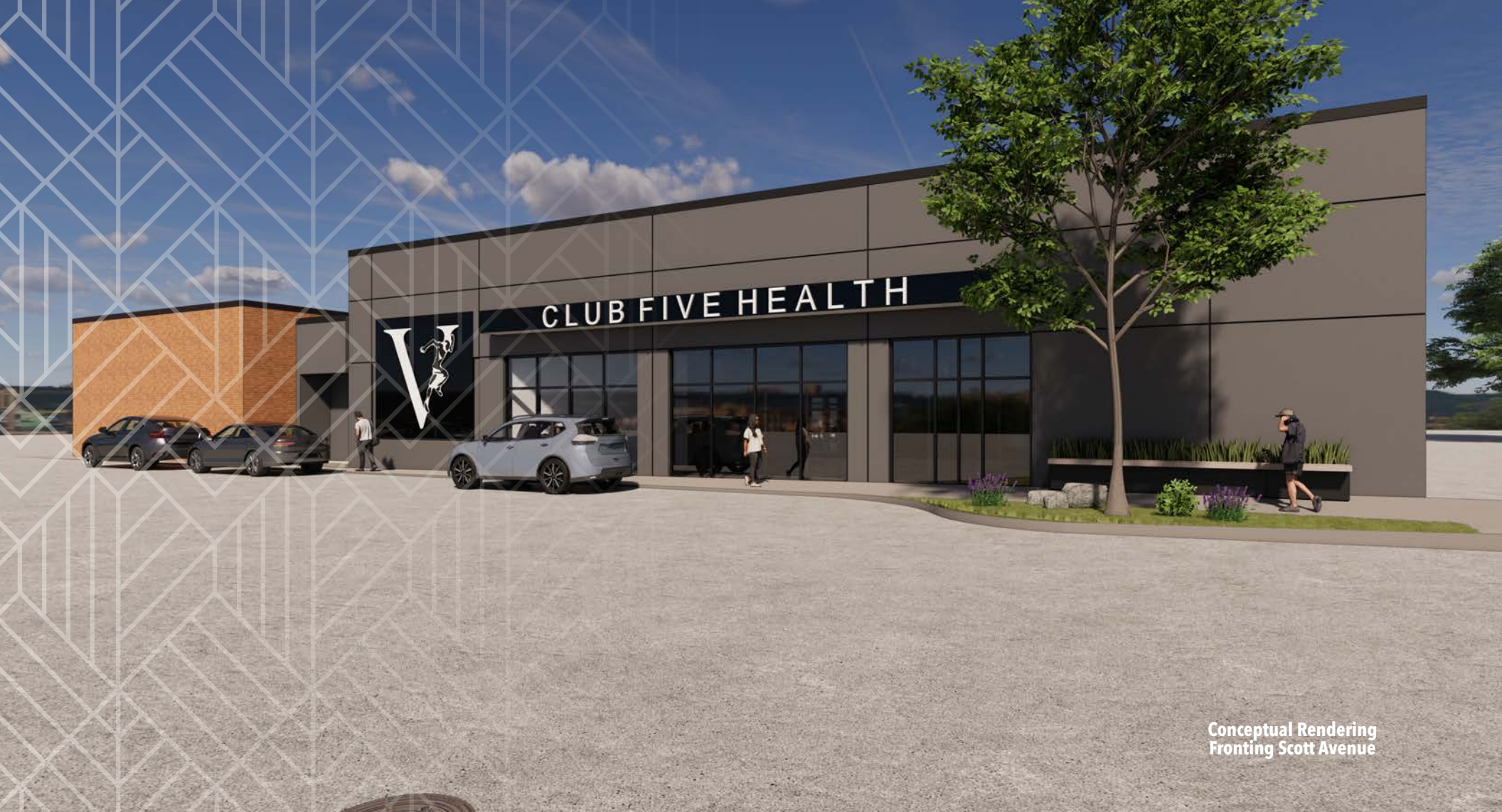
Conceptual Rendering Fronting Scott Avenue