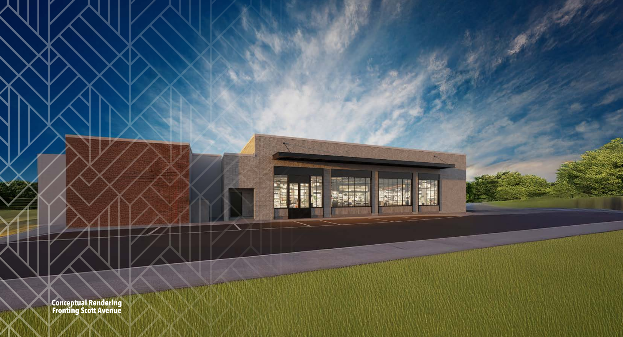
Conceptual Rendering Fronting Scott Avenue