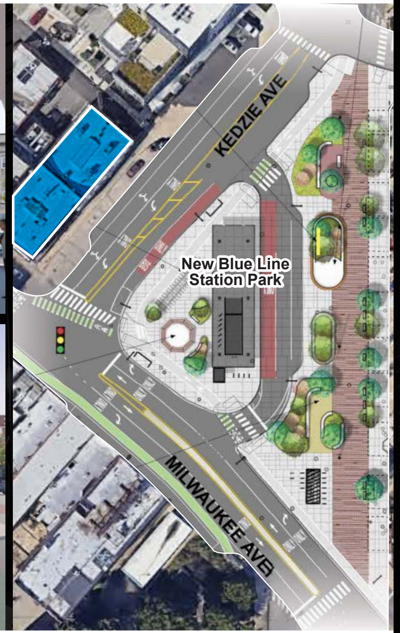
LOGAN SQUARE STATION REMODEL