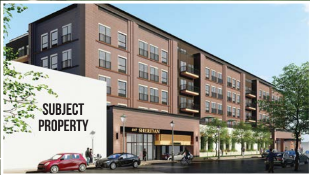
NEW RESIDENTIAL DEVELOPMENT (95 UNITS)