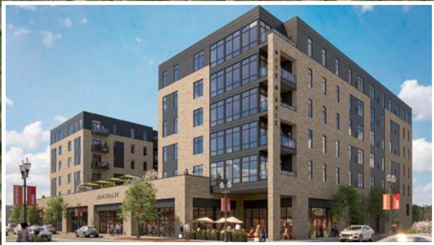
NEW RESIDENTIAL DEVELOPMENT (103 UNITS)